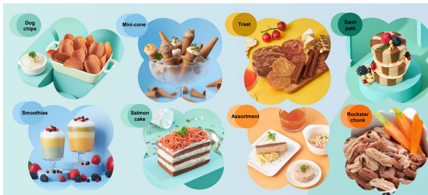
Figure 1: Implementing humanised innovation to drive the well-being of pets